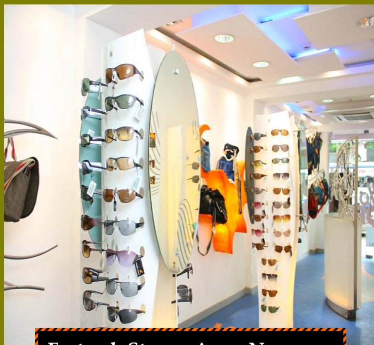
Fastrack Store – Anna Nagar